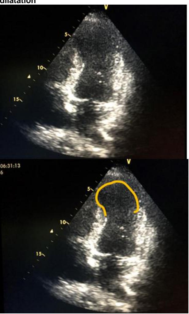
Figure 2: Apical 4C view showing large area of apical involvement with some aneurysmal dilatation

CT scan of the chest showed no evidence of pneumothorax or pleural effusion.