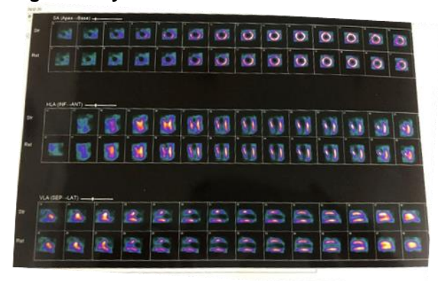
Figure 4: Myocardial Perfusion Scan

After the presentation here he was managed with IV diuretics, ACE inhibitors, statin, anti-platelet agents and aldosterone. In about 2 days, the patient improved remarkably (gained NYHA functional class II) and was discharged on the fourth day. He gained NYHA functional class I in next 15 days. Eight weeks after the index event, an MPS done for any viable myocardium, which revealed good exercise tolerance (total exercise time 9 minutes 30 seconds achieving 100% THR) with evidence of large fixed defect involving apex, anterior septum and apical anterior wall, Figure 4. No evidence of reversible defect (viable myocardium) was noted. He was advised the same treatment and regular follow-up.