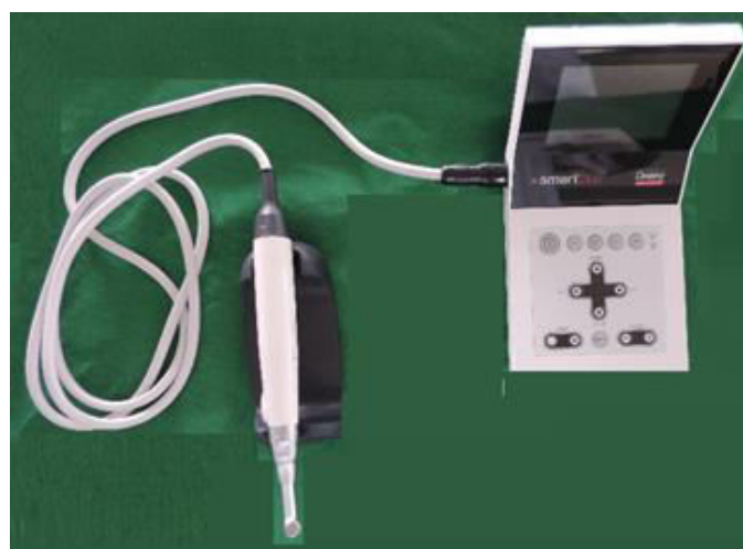
Fig. 11 X Smart Plus Endo motor