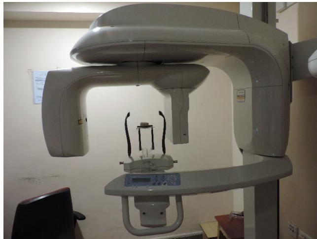
Fig. 1: Cone Beam Computed Tomography