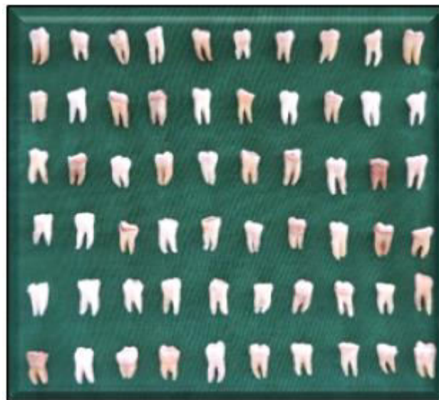
Fig. 6 Collected test sample teeth