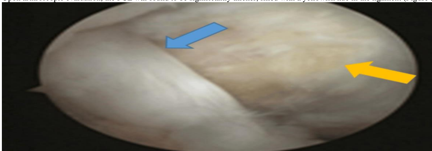
FIGURE 3: Arthroscopic image showing normal anterior cruciate ligament and thickened PCL.

Upon arthroscopic evaluation, the PCL was found to be significantly thicker, filled with a yellowish hue in the ligament (Figure 3).